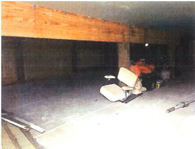
79 Oregon Avenue, crawl space, 01/15/15