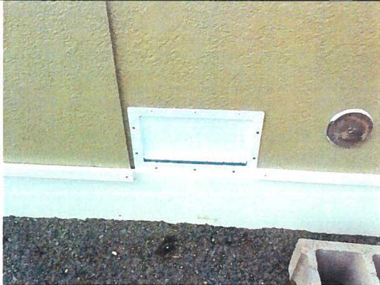
79 Oregon Avenue, Air Vent, 01/15/15

If submitting more photographs than will fit on the preceding page, affix the additional photographs below. Identify all photographs with: date taken; "Front View" and "Rear View"; and, if required, "Right Side View" and "Left Side View." When applicable, photographs must show the foundation with representative examples of the flood openings or vents, as indicated in Section A8.