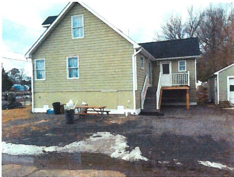
79 Oregon Avenue, Rear/right side 01/15/15