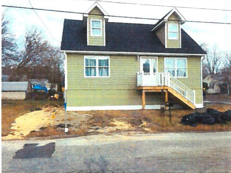
79 Oregon Avenue, Front, 01/15/15

If using the Elevation Certificate to obtain NFIP flood insurance, affix at least 2 building photographs below according to the instructions for Item A6. Identify all photographs with date taken; "Front View" and "Rear View"; and, if required, "Right Side View" and "Left Side View." When applicable, photographs must show the foundation with representative examples of the flood openings or vents, as indicated in Section A8. If submitting more photographs than will fit on this page, use the Continuation Page.